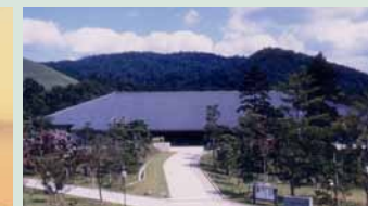
Nara Prefectural New Public Hall