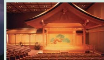
Noh theater: used as the auditorium for morning lectures.